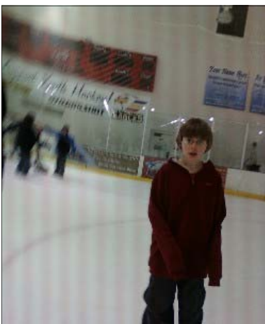
He Did Bring Gloves, But... (It's A Guy Thing)

Also, the annual Youth Leadership Conference is coming up, February 27th through March 1st. The event, held at Snow Mountain Ranch in Winter Park, invites youth from Colorado, Wyoming, and Utah to come together for the long weekend to sing, worship, and learn about becoming leaders in their church communities.